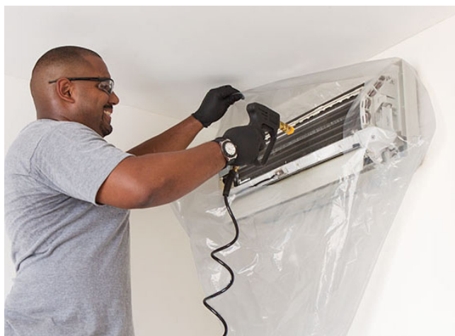
Cleaning of indoor units with SPLIT-BAG protection (optional)